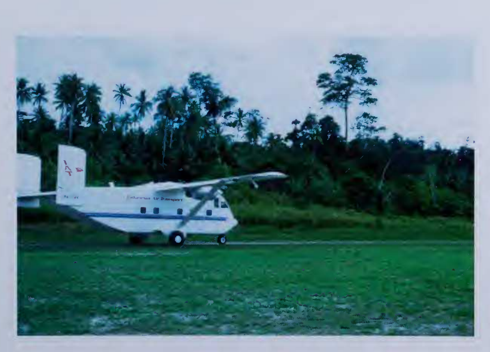
Figure 3 Airstrip with rank herbage and kebun.